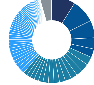
Cash > 10% 5-10% 2-5% < 2%